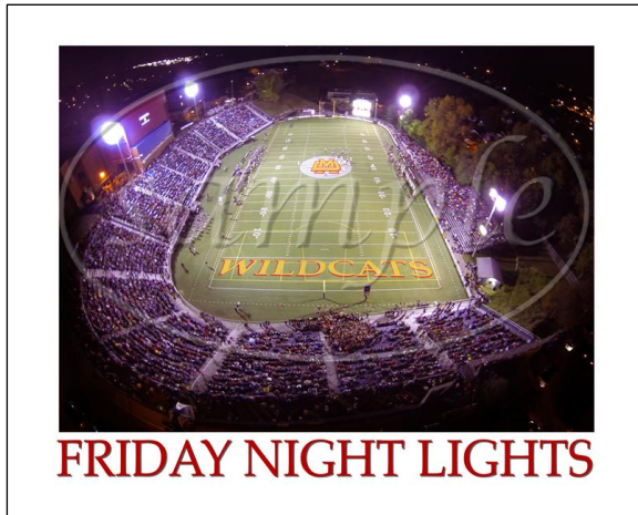
Option 1 w/ MD logo Black frame with gold inlay

All orders are due back to Westside Catholic School by Friday, December 13 . All orders will be ready for pick-up by Friday, December 20, at the St. Boniface School Campus.