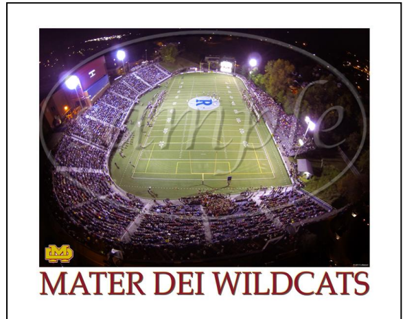
Option 2 w/ Reitz logo Black frame with blue inlay