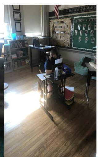
PreAlgebra Inequality Hunt